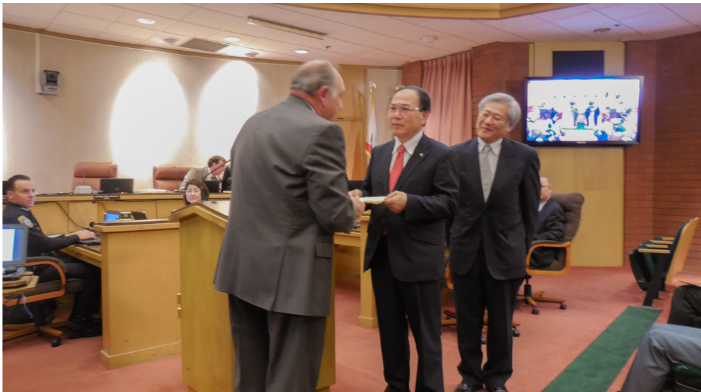
Former mayor Toni Spitaleri hands agreement to Morichika Saito and Masato Watanabe