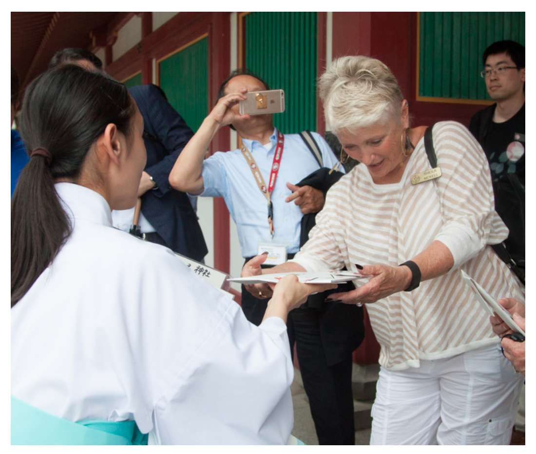
"When you experience a different culture you gain a deeper understanding of yourself and those around you—deepening your knowledge about the world in a way that books, school assignments, and a professional career can never reveal."

on this trip and they are very excited to meet new friends in Sunnyvale. Please say "hi" to them when you see them during their visit.