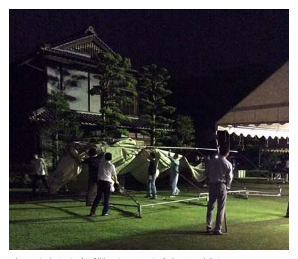
Volunteers cleaning the site of the S2I farewell party at the Aso family residence in lizuka

No story about Japan is complete without mentioning food! Japanese food is amazing and our group devoured it! From our first grocery store dinner trip to tempura and sushi, the welcome buffet, school lunches and dinners prepared by our host families, we ate well. I loved watching the students get their last ramen and Japanese food at the airport before we left and then say they wanted their first meals back in the US....to be Japanese food!